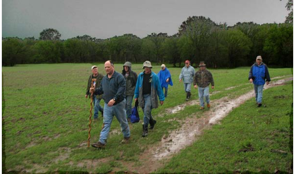
Moses (Howard, with the staff) leading some of the Israelites through the wilderness. The others were wandering elsewhere – something about a golden calf – but returned when he threatened to smite them.